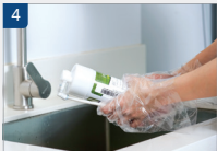
4 Filter backwash / flushing