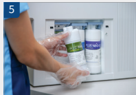
5 New filter flushing