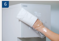
6 External cleaning