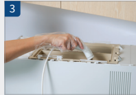
3 Tank rinsing