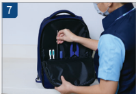
7 Service completed