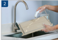
2 Tank sterilising